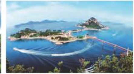
Seonyu-island Marine park boasting beautiful scenery created by nature