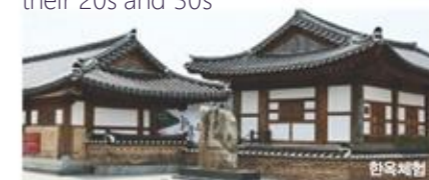
Hanok Experience Experience Korean traditional lifestyle Experience various traditional cultures.