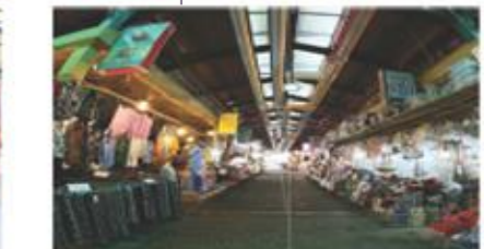
Jeonju Night Market Essential course for events held only on Fridays and Saturdays