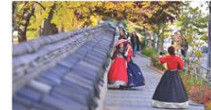
Hanbok Experience Make unique memories by wearing fashionable hanbok(clothes)