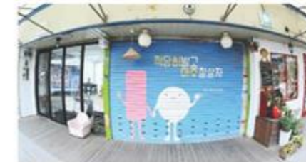
Southern Market Youth Mall A place decorated with passion and diverse stories of young people in their 20s and 30s