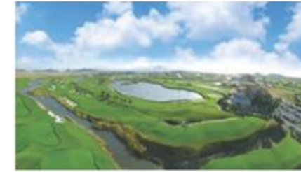
Gunsan CC Largest scale in Korea with 810,000 square meters and 81 holes The only golf course floating on the lake in the world