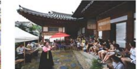
traditional village A place for performances, food and cultural experiences